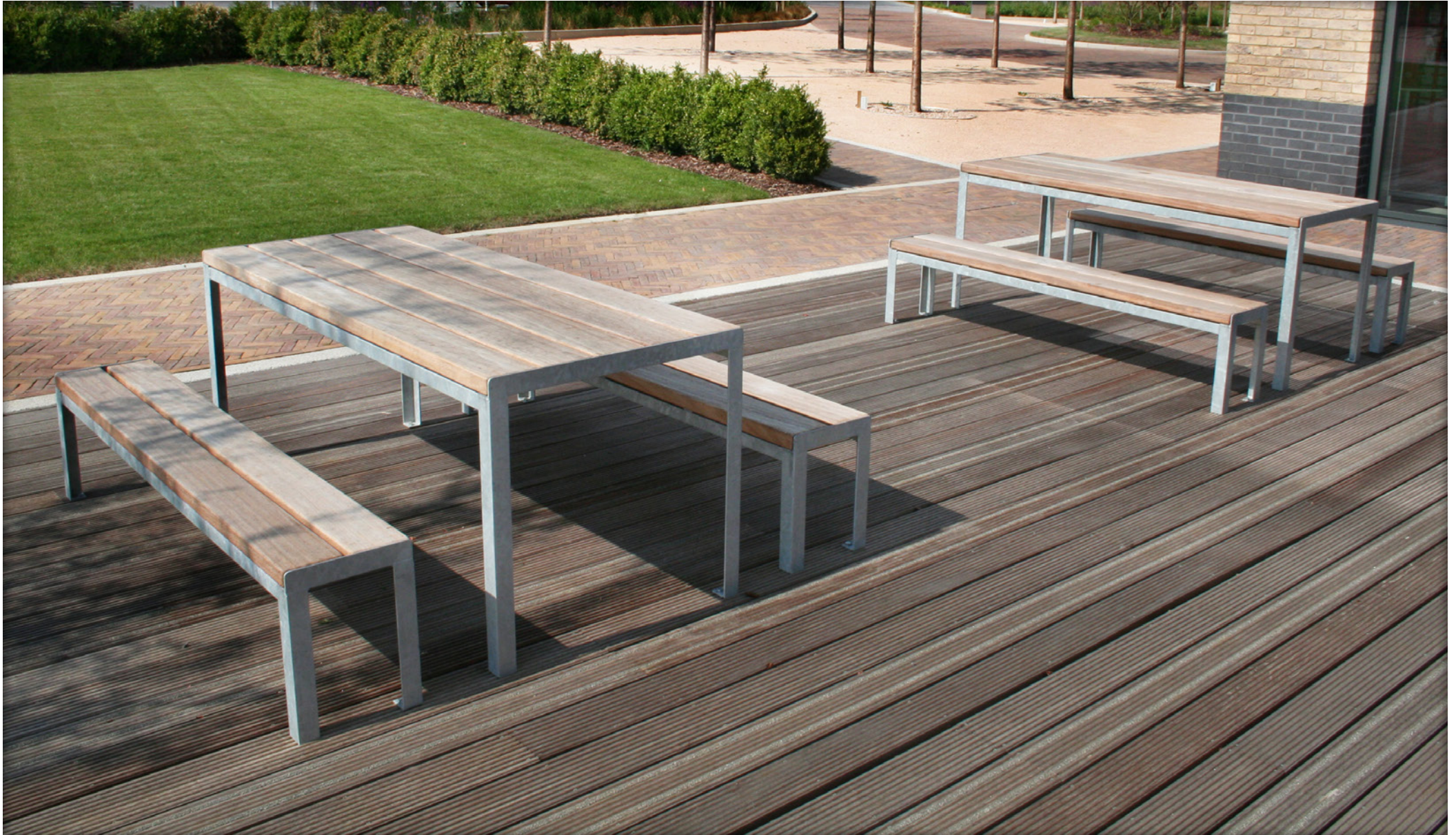
SPT318/C/GI/GL AND SBN332/C/HI/GL