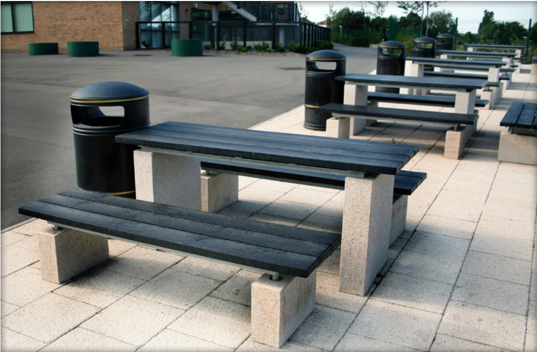
SPT312/D-BG/RP-BK/GL AND SBN310/D-BG/RP-BK/GL