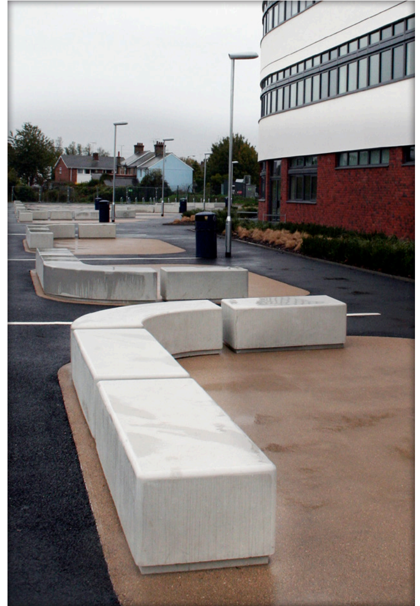
PBN412/FS/LG/DP (WITH PBN411)