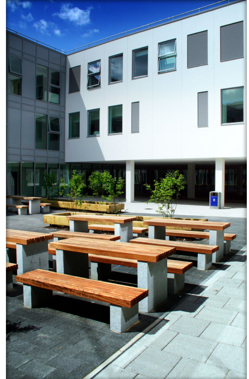
LPT105/D-GG/RP-BK/GL AND LBN114/D-GG/RP-BK/GL