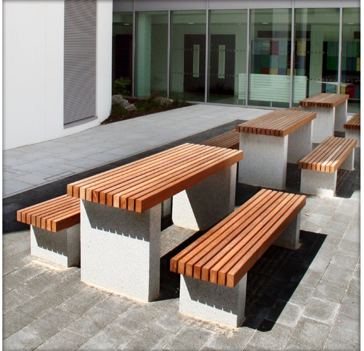
LPT105/D-GG/HI/GL AND LBN114/D-GG/HI/GL