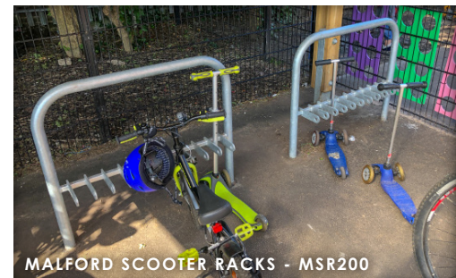
MALFORD SCOOTER RACKS - MSR200