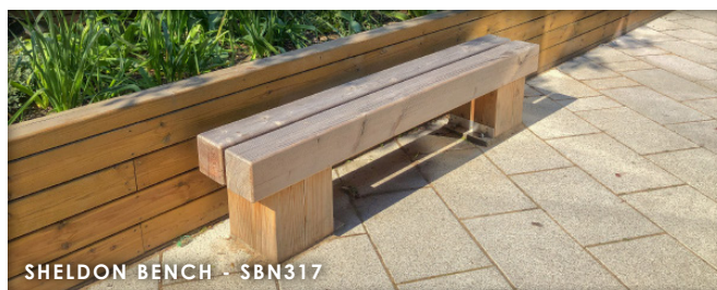
SHELDON BENCH - SBN317