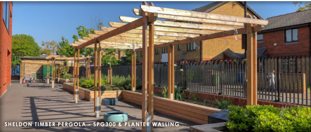
SHELDON TIMBER PERGOLA - SPG300 & PLANTER WALLING