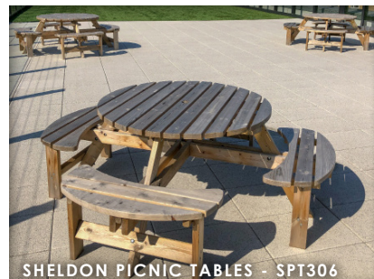
SHELDON PICNIC TABLES - SPT306