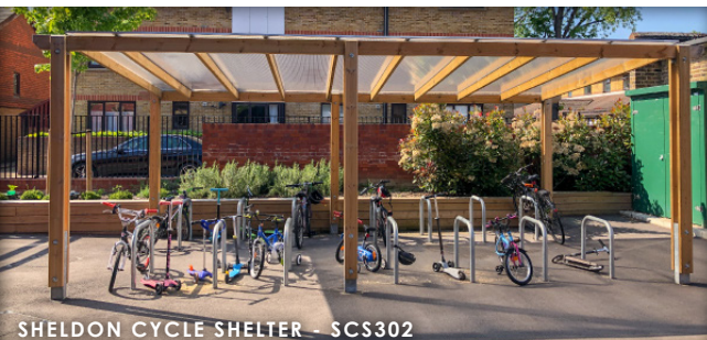
SHELDON CYCLE SHELTER - SCS302