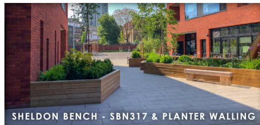
SHELDON BENCH - SBN317 & PLANTER WALLING