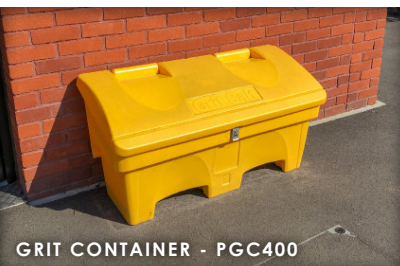
GRIT CONTAINER - PGC400