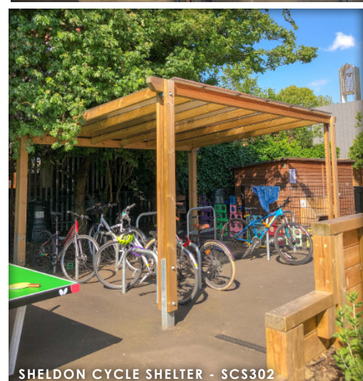
SHELDON CYCLE SHELTER - SCS302

Albion Primary School is situated in the heart of Rotherhithe, a peninsula on the south bank of the Thames and is in the London Borough of Southwark. The school was completely revamped in order to increase capacity to a full two-form entry facility.