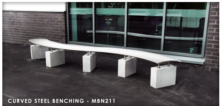
CURVED STEEL BENCHING - MBN211