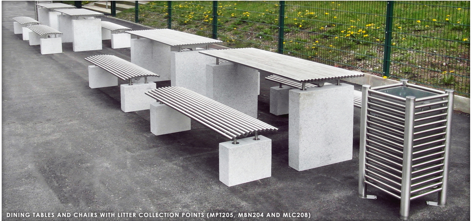
DINING TABLES AND CHAIRS WITH LITTER COLLECTION POINTS (MPT205, MBN204 AND MLC208)