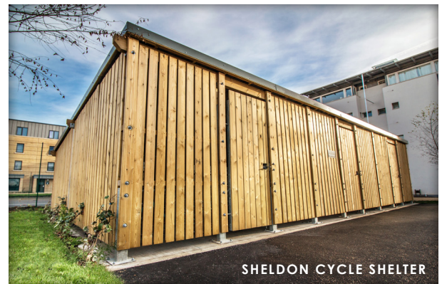
SHELDON CYCLE SHELTER