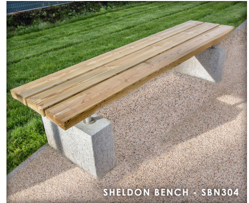
SHELDON BENCH - SBN304