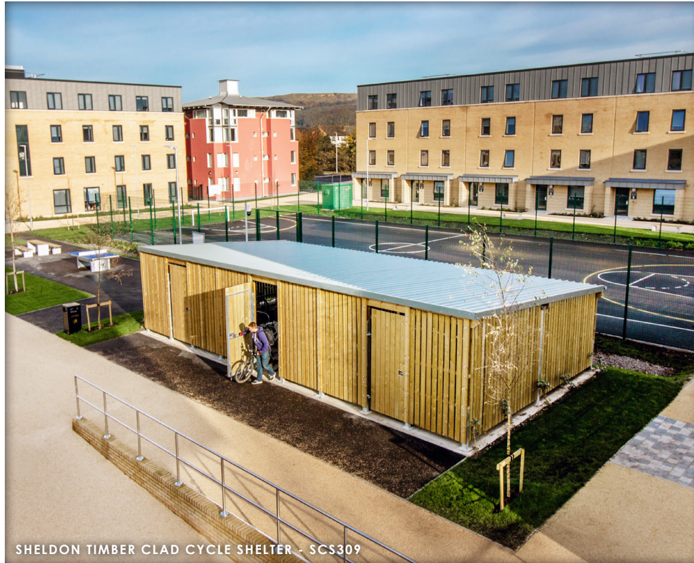
SHELDON TIMBER CLAD CYCLE SHELTER - SCS309