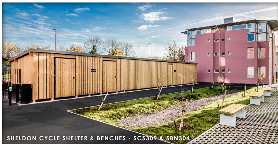
SHELDON CYCLE SHELTER &amp; BENCHES - SCS309 &amp; SBN304

Project Name: University of Gloucestershire, Pittville Cheltenham