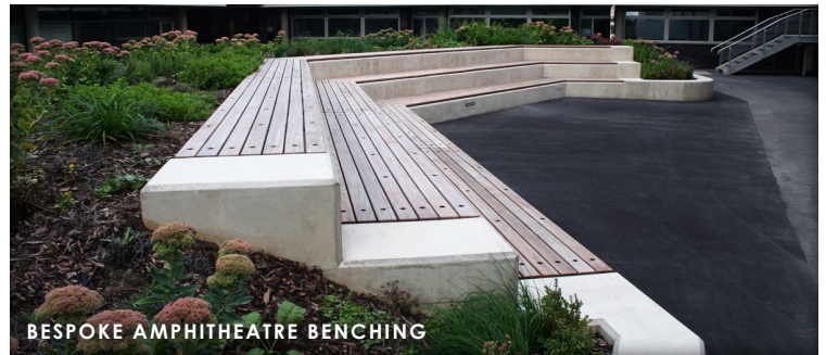
BESPOKE AMPHITHEATRE BENCHING