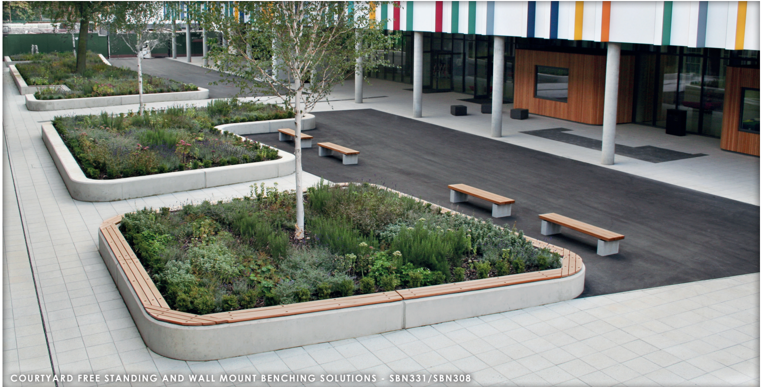
COURTYARD FREE STANDING AND WALL MOUNT BENCHING SOLUTIONS - SBN331/SBN308