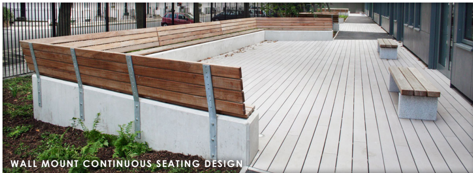
WALL MOUNT CONTINUOUS SEATING DESIGN

Project Name: Regents High School London